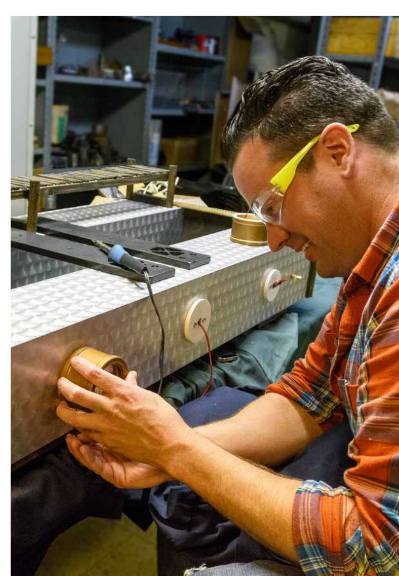
Students working on the 2017 capstone projects – scale models of the U.S.S. Monitor