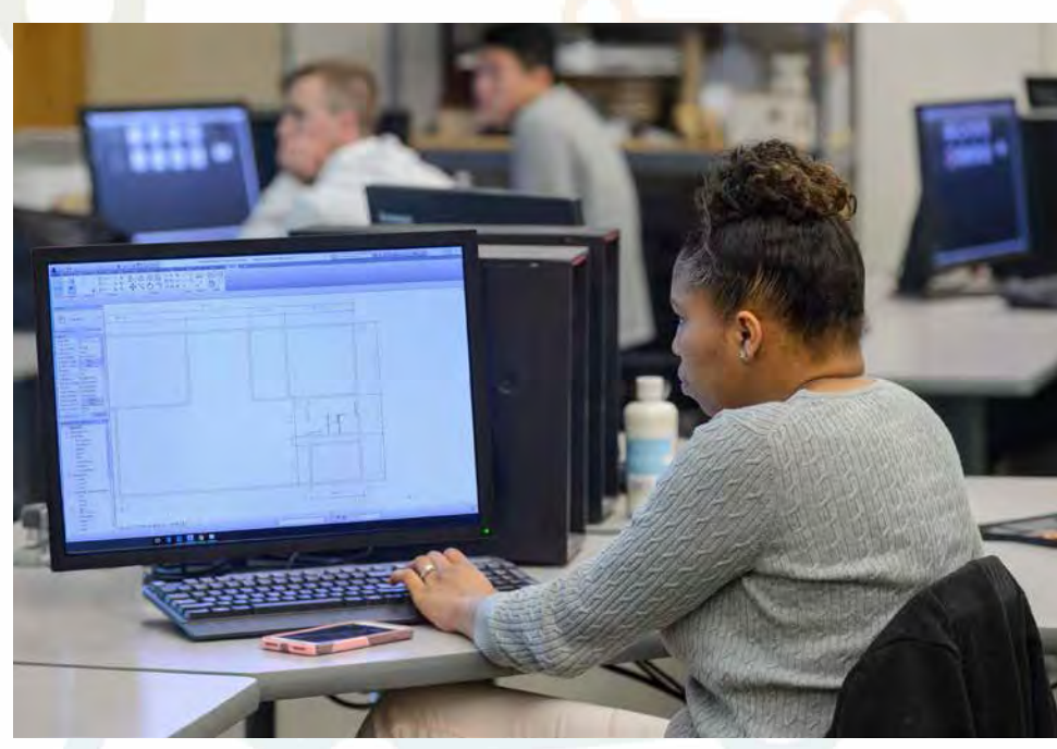
Student in architectural technology class

Jobs that made both lists are projected to both have the most openings and grow the fastest. They include web developers, computer user support specialists and computer network support specialists, civil engineering technicians, and