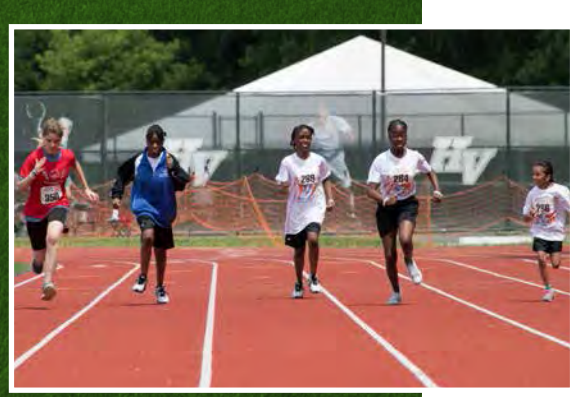
The 2017 NYS Special Olympics took place at Hudson Valley's OAC

This project is the epitome of a team effort, with a strong partnership between the college, its Faculty Student Association, New York State, the Student Senate, the Athletic Department, and corporate and individual donors, as well as the students of Hudson Valley. Each of the last five graduating classes designated a portion of their class gift toward the creation of the complex, helping this vision to become a reality.