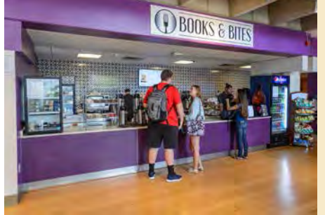
PRIME Books & Bites